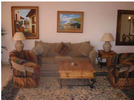
Each condo is luxuriously appointed!!!