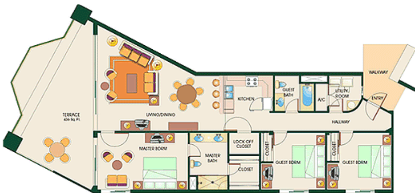
Three Bedroom Floor Plan

room size | condo - 1,141 sq ft | terrace - 300 sq ft | total - 1,441 sq ft