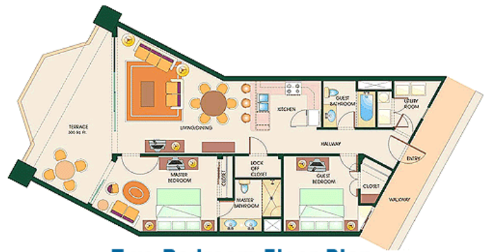
Two Bedroom Floor Plan

room size | condo - 734 sq ft | terrace - 137 sq ft | total - 871 sq ft