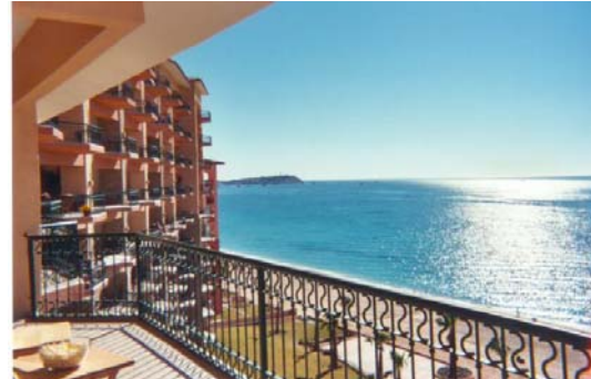
Breathtaking Ocean views await!!!!