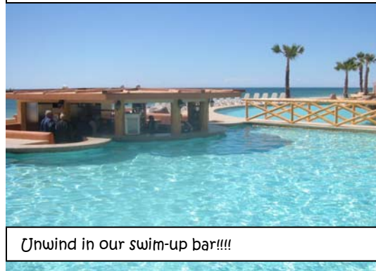
Unwind in our swim-up bar!!!!