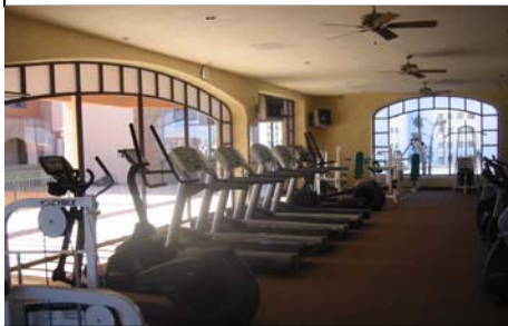
State of the art fitness area!!!