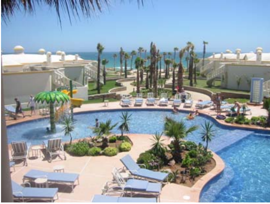
Spectacular views from the clubhouse restaurant!