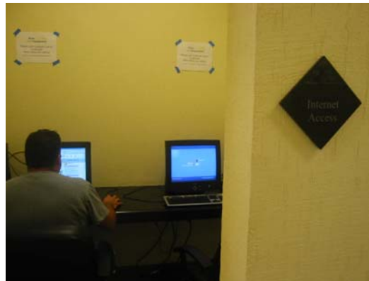
High Speed internet access in lobby area