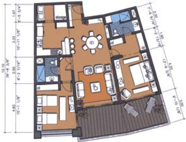
CONDominio DE 2 RECAMARAS 2 BEDROOM APARTMENT

1,518 total sq.ft. including 287 sq.ft. terrace