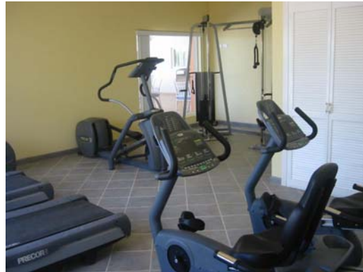
Fitness Room w/ Steam Room Facilities