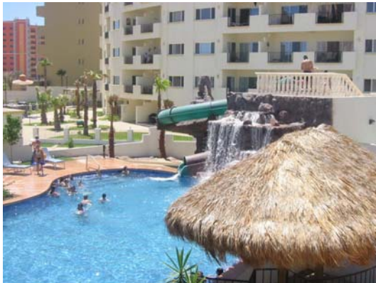
Rocky Point's only full size waterslide!!!