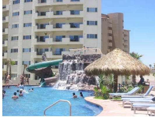
Palapa-covered swim-up bar Now open!