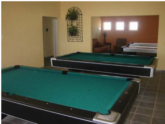
Game room (Pool tables, air hockey)